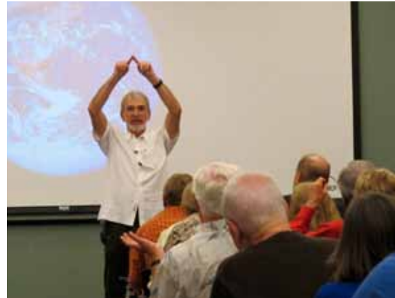
Monthly lectures are held at both the Incline Village and Tahoe City locations