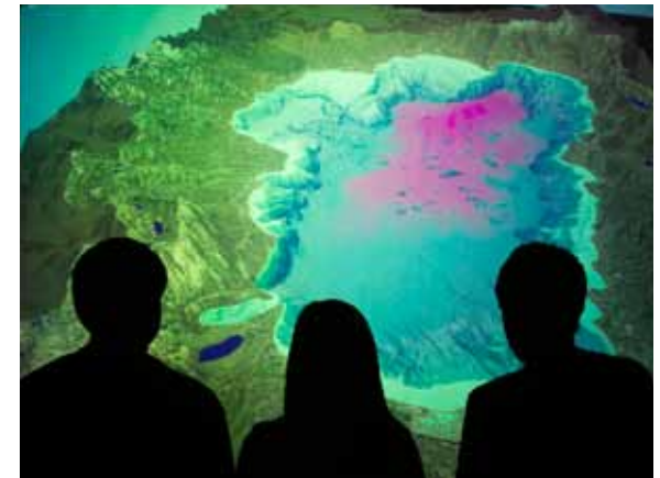
The award-winning 3D movie “Lake Tahoe in Depth” (16 minutes) continues to show at the 3D Theater in Incline Village.