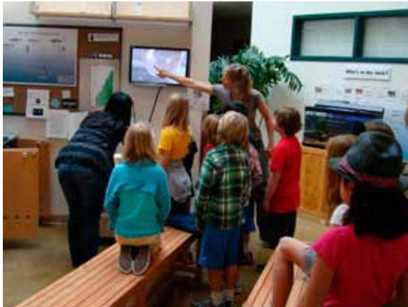
School groups visit for informal science education programs on water, geology and biology

For the past several years, TERC has hosted a summer Tahoe Teacher Institute for educators from both California and Nevada.