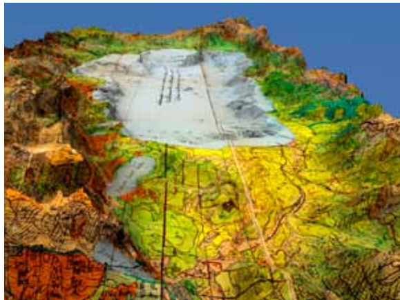
Historic vegetation transect maps conducted in the 1930s are compared with modern remotely sensed maps to find changes in vegetation types in the Sierra.

“Lake Tahoe in Depth” 3D short film (16 minutes) continues to be a huge success in the 3D Theater as well.