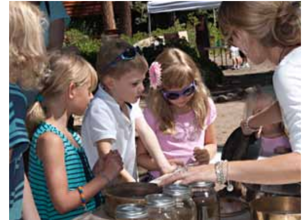
Children's Environmental Science Day is held annually each August with hands-on science activities designed for kids ages six and up