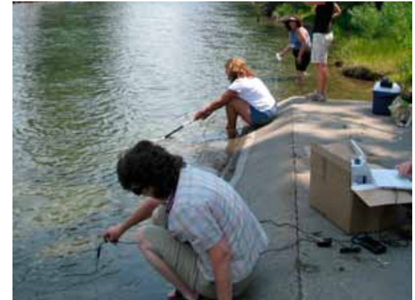
Teachers come to Lake Tahoe for the Tahoe Summer Institute to improve their proficiency in environmental science topics and learn new science activities