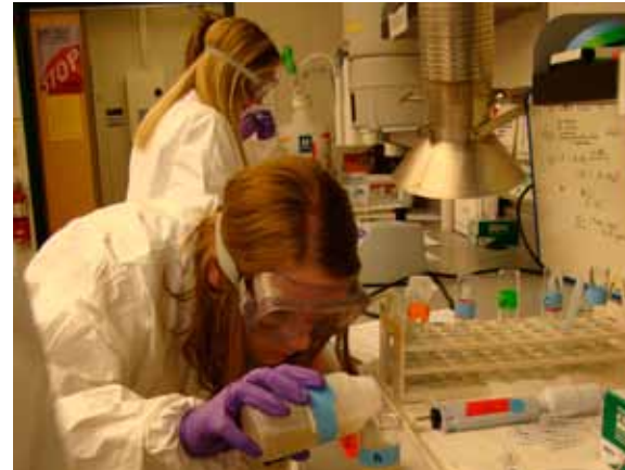
Youth Science Institute participants conduct science activities to improve their confidence in various scientific fields