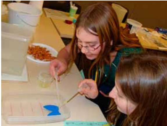
The annual Science Expo held each March brings in more than 600 third-, fourth- and fifth-grade students for hands-on science activities

Science Day (August), Earth Science Day (October), and Family Science Day (December)