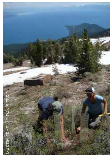
Forest ecology research team checks restoration plantings on Rifle Peak above Crystal Bay

Forests around lake level have seen impacts due to mountain pine beetle and drought, whereas high elevation forests have seen slow, creeping continuous damage due to white pine blister rust. Mountain