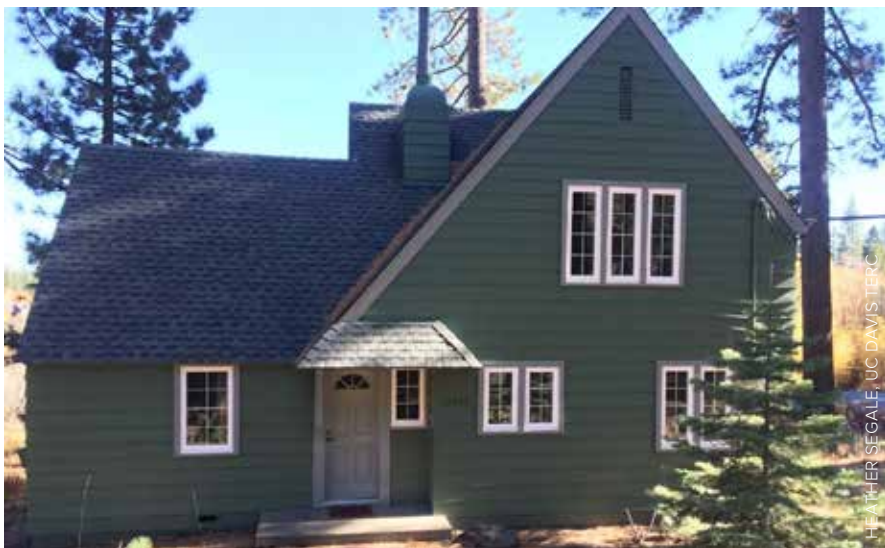
Malyj Manor (formerly the "Blue House") has provided lodging for graduate students and visiting researchers for decades and recently received several major upgrades by UC Davis Facilities