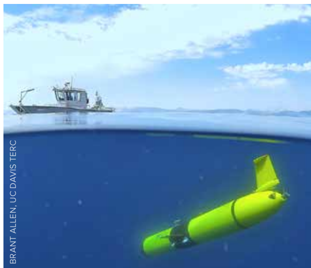
Storm Petrel initiating a dive in Lake Tahoe

waves affect the lake’s thermal structure, mixing, and nutrient and gas cycling. Unlike waves caused by wind, internal waves are caused by velocity variations deep within the lake. In Lake Tahoe, they typically occur at the thermocline – the interface between the warm upper