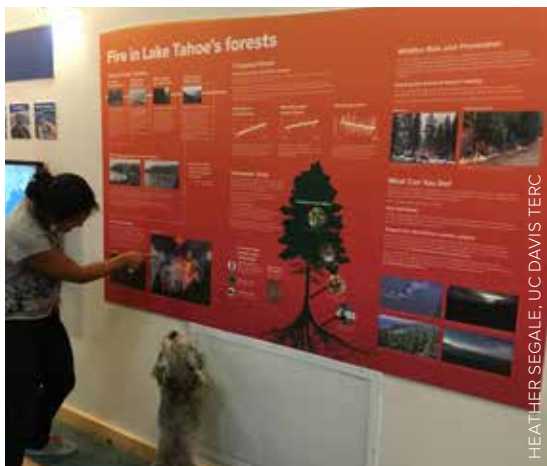
Fire in Lake Tahoe's Forests exhibit now includes actual beetles and beetle galleries... can you follow the path of the adults and larvae?

TERC is working with app developer Arborglyph to develop a new State of the Lake iPad interactive exhibit that will highlight information about lake clarity, changing lake level, climate change, forest health, and provide a visitor survey. It will replace the existing iPad app.