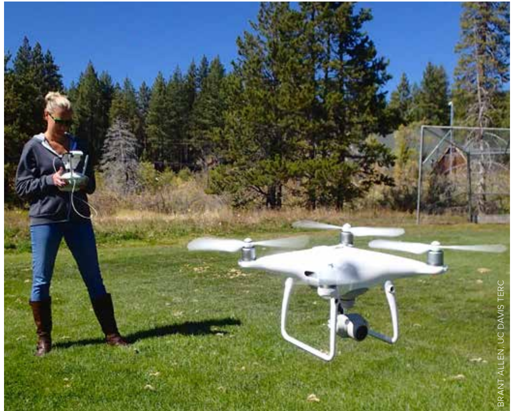
TERC researcher Katie Senft preparing the drone for flight