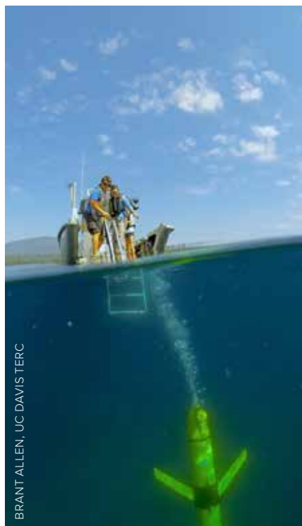
Storm Petrel initiates a dive into Lake Tahoe to begin east-west transects

layer of water that sits atop the colder denser water. These waves, which can be 10 meters high in Lake Tahoe, are slow moving. The shortest wave period occurs in about 18 hours, while the longest can be up to 125 hours. Understanding internal wave properties is giving McNerney and the TERC team a better idea of how internal waves can interact with the bottom of the lake. Disturbances in the water may lead to erosion around structures such as piers, pipelines, and cables. Additionally, internal waves can promote lake mixing, a process that is beneficial for cycling nutrients and gases, but can also contribute to particle resuspension.