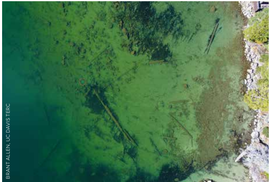
Drone image of Cascade Lake with TERC underwater nearshore sensor station circled in red