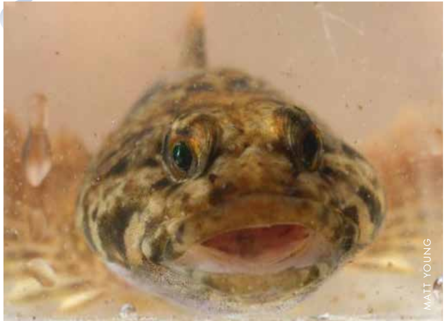
PAIUTE SCULPIN found living inside nearshore network sensor at bottom of Lake Tahoe